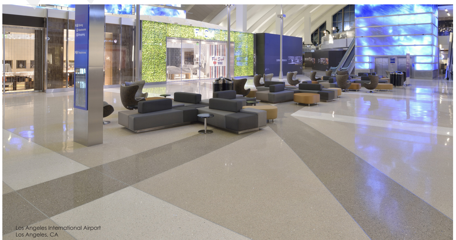
Los Angeles International Airport Los Angeles, CA

As lifecycle costs seem to be an important focus within airport establishments, terrazzo proves to be a perfect fit. Terrazzo's impeccable durability and strength is ideal for all of the various high traffic areas found within an airport including security, terminals, baggage claims and the other establishments within airports such as car rental facilities, restaurants and other retail shops. As the initial cost for other flooring systems might appear to be more affordable, don't be fooled by an initial savings that will cost you more in the long run. Other flooring systems such as carpet or vinyl tile have to be replaced frequently especially in these large, high traffic areas, while terrazzo stands the test of time. Its functionality and performance surpassing that of other flooring systems and typically lasting the lifetime of the building.