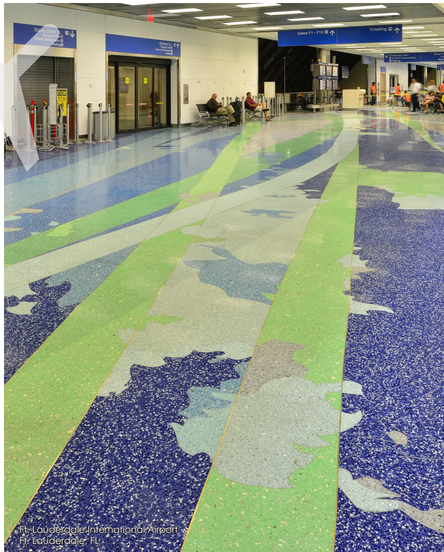
Ft. Lauderdale International Airport Ft. Lauderdale, FL

Epoxy terrazzo is an inorganic based binder containing no Volatile Organic Compounds (VOC). Therefore, epoxy matrix will not threaten indoor air quality with potentially harmful off-gassing during or after the installation process.