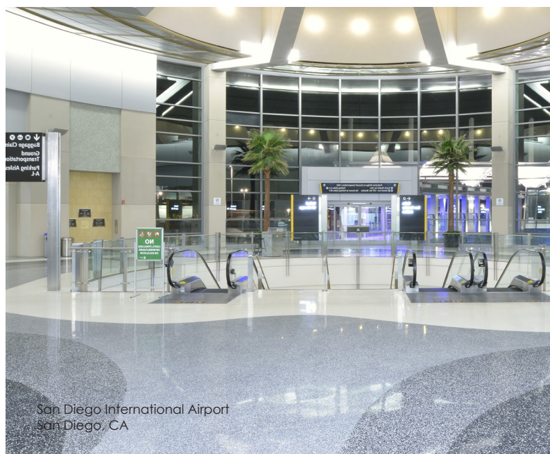
San Diego International Airport San Diego, CA

The seamless feature of terrazzo floors also eliminates the potential for dirt to build up in grout joints. No seams also allows for travelers to commute from one side of the airport to the other at ease without the impediment of grout joints for their wheeled luggage.